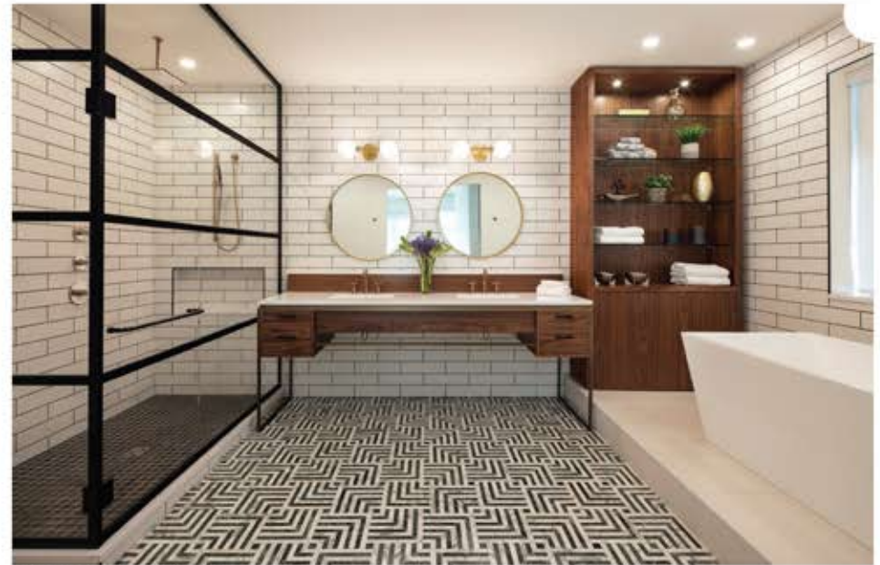
Builder: TQ Construction.

Ovation Awards reflect today's housing market and trends, with multiple categories for kitchen and bath renovations (under $35,000; under $75,000; over $125,000 etc). Great room renovations get a nod too, as do exterior and overall renovations from under $200,000 to over $1 million. New home and design categories are prominent, including custom homes valued at $1, $2 and $3 million, along with outdoor living spaces, special features, innovations and high-performance building science.