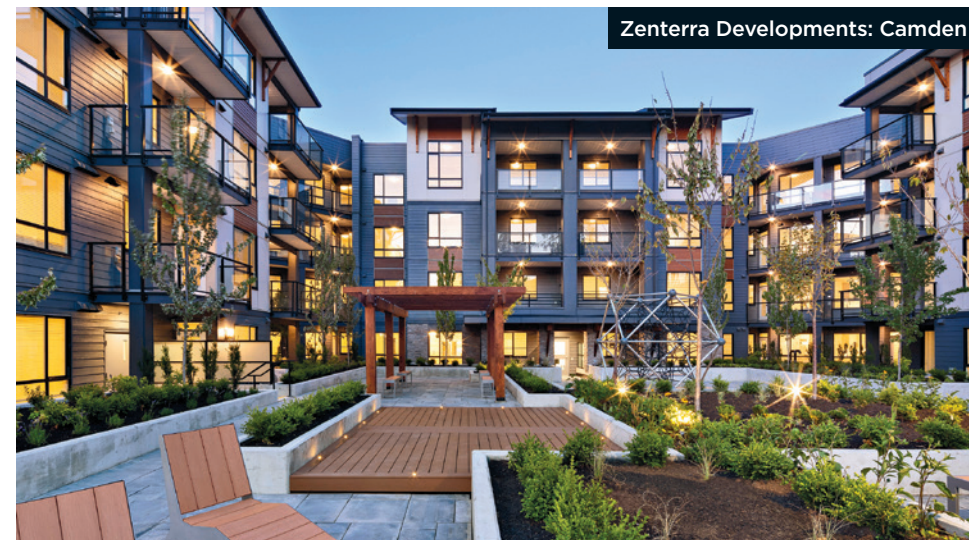
Zenterra Developments: Camden