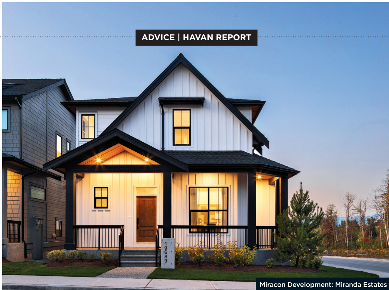
Miracon Development: Miranda Estates